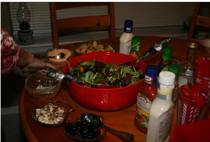
The "salad bar"